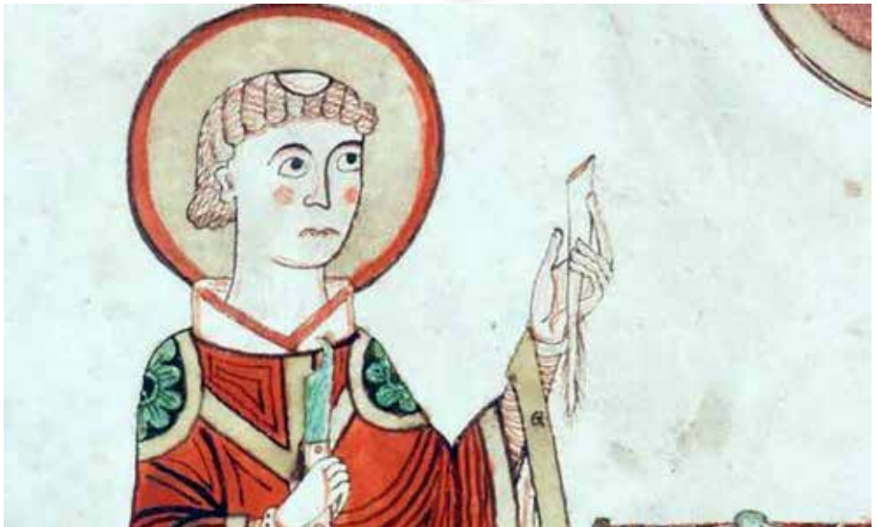
Bede, 12th Century manuscript.

Long before the events described in the New Testament, the Jewish people kept a harvest festival known as the Feast of Weeks. They brought the first sheaves of grain to God as a sign of gratitude and they remembered how, fifty days after the first Passover, God had given the Law to Moses on Mount Sinai in fire and thunder. Two loaves of bread baked from newly