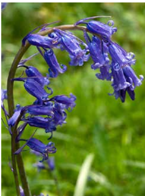
Bluebell at Ramster Hall.

The felling of the ash trees at the Recreation Ground has now been completed. While their removal was necessary, we recognise the importance of maintaining and enhancing our green spaces. We are pleased to confirm that these trees will be replaced with disease resistant English Elm trees in the near future by our biodiversity team, helping to support the long-term health, resilience, and biodiversity of the area.